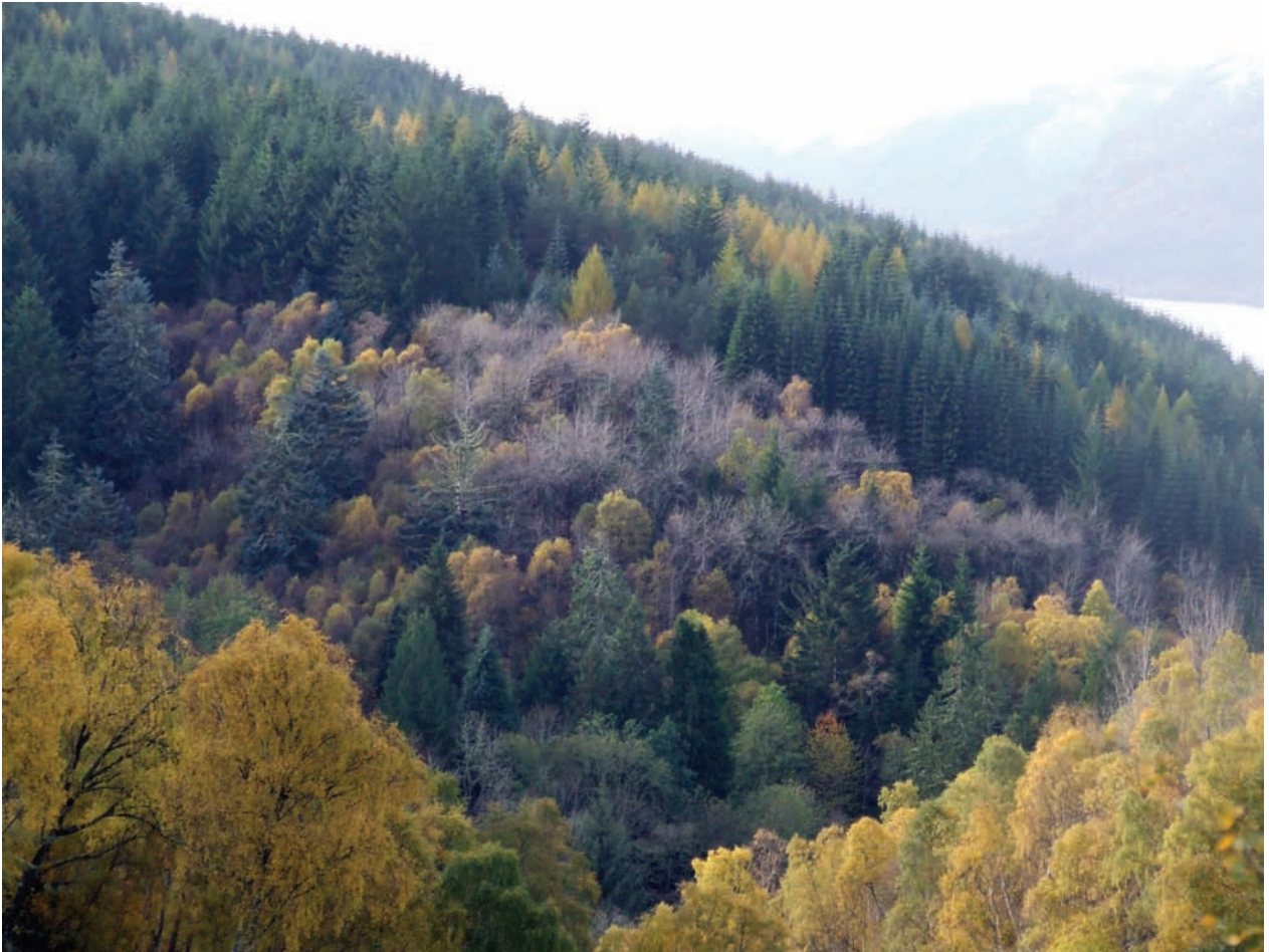
Two of the largest Aspen stands in South Loch Ness: Above : Fasnagruig (1.15 ha) on land managed by Forestry Commission Scotland. Below : An Doirlinn (0.61 ha) on Dell Estate