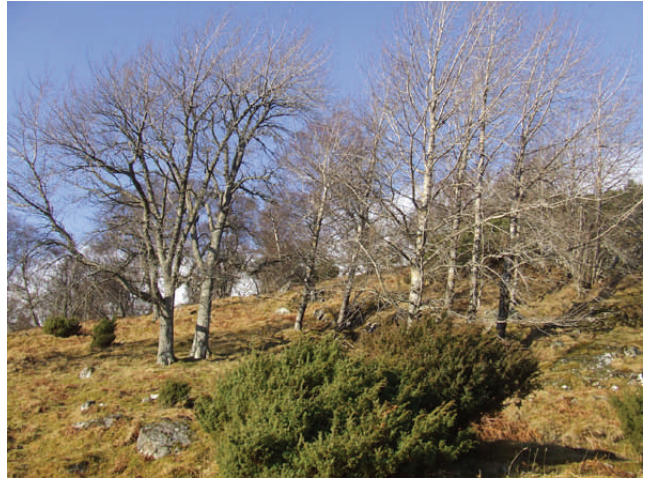
Right: A stand above the Allt Caol has little prospect of expansion until adjacent conifers are felled and grazing levels are reduced

Many of the stands are located on crags, steep slopes, boulder fields and gorges, where aspen suckers experience lower browsing pressure than elsewhere.