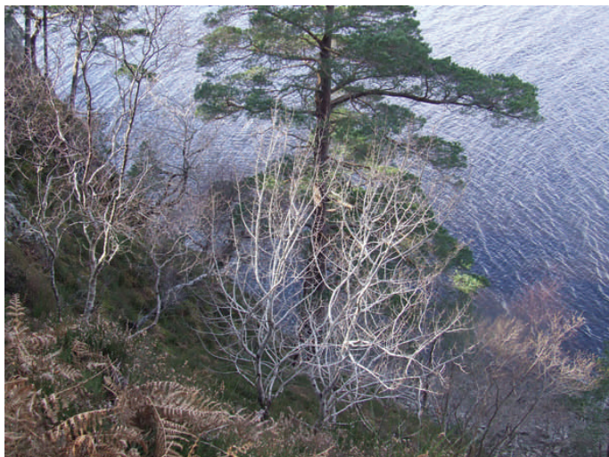
Above: A small Aspen stand on a vertiginous slope above Loch Ness

Aspen stands were recorded from just above sea-level at Loch Ness to an altitude of over 500 metres a.s.l. where remnant riparian woodlands peter out on the high Monadhliaths. The highest stand recorded is at 531 m a.s.l. This altitudinal range is only matched in South Loch Ness by two other tree species: downy birch and rowan.