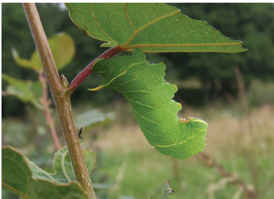
Poplar Hawkmoth larva on a young planted Aspen by the River E