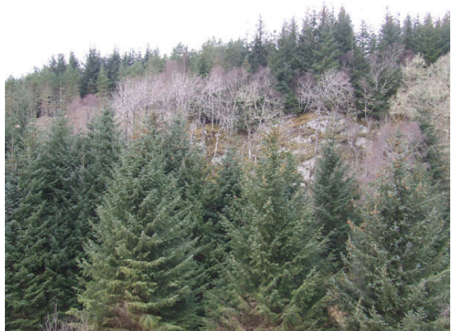
Left: Conifers were clearfelled from a large area below Erroglie in about 2002, exposing this small stand above Allt na Goibhre

Many of the stands are located on crags, steep slopes, boulder fields and gorges, where aspen suckers experience lower browsing pressure than elsewhere.