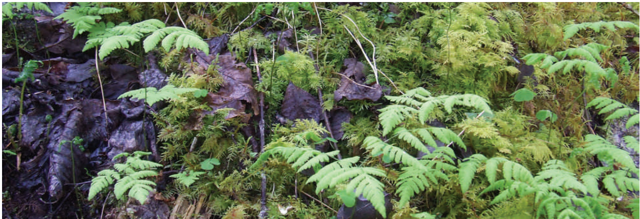
Below: Oak fern