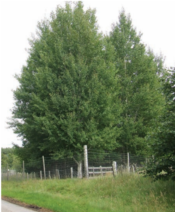
Where Aspen has been planted in recent new native woodland schemes, it has performed well. If local-origin planting material were more readily available, it would certainly be a more popular choice with foresters.

Proposals for management have already been discussed with some owners. These include a site meeting with FCS staff to discuss management of the stand at Fasnagruig.