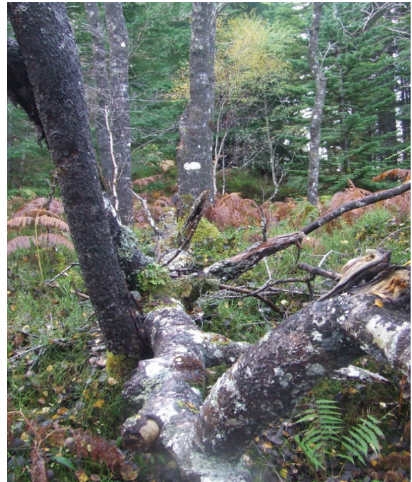
The supply of naturally-fallen Aspen deadwood at Fasnagruig is probably inadequate to securely sustain a population of Hammerschmidtia . Some intervention could provide biodiversity benefits.