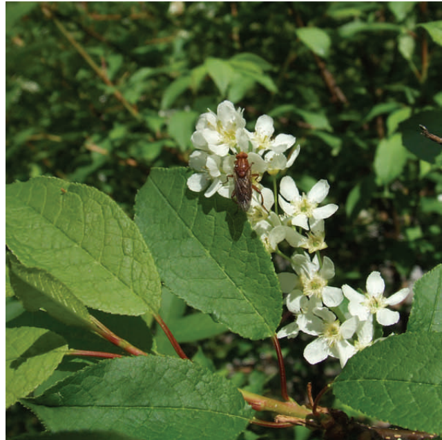
The Aspen hoverfly Hammerschmidtia ferruginea has been recorded at one location in South Loch Ness

The objective of this survey was to survey and map Aspen stands in South Loch Ness with the assistance of local volunteers. The survey was mainly undertaken during 2009, and covered an area of about 300 square kilometres.