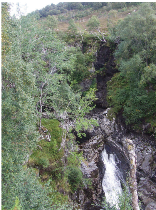
Right: A number of small Aspen stands are found in inaccessible locations at high altitude; this stand is in Glen Markie, a tributary of the River Fechlin, at over 400m a.s.l.