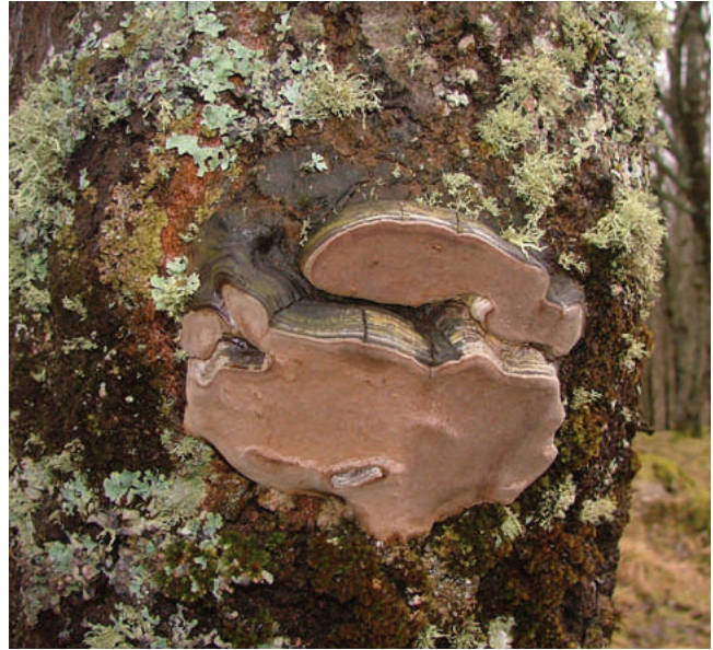
Phellinus tremulae , a bracket fungus found only on Aspen

This rare hoverfly depends on Aspen deadwood. It is a priority BAP species. Graham Rotheray and Iain MacGowan observed it at Fasnagruig in 2002, but no attempt has since been made to re-locate it.